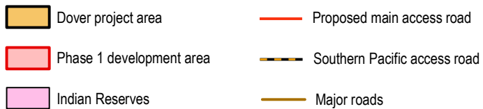
Figure 1. Regional setting